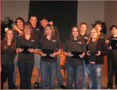
The GPBC Friends Choir sang "Do You Hear What I Hear?"